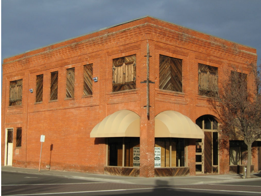
Figure 3: 201 E Main St (Skinner Building)