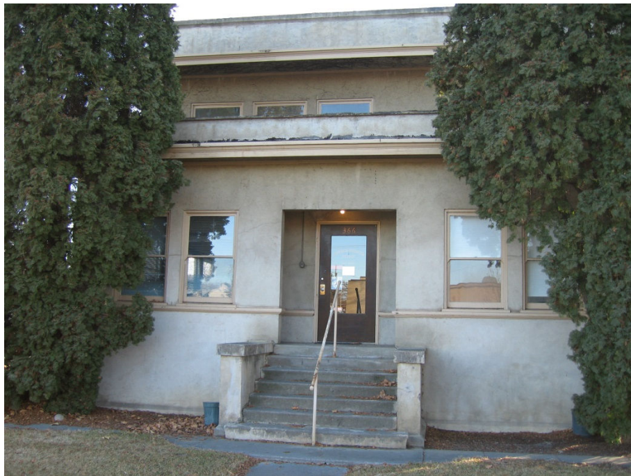
Figure 1: 366 E Hurlburt Ave (Hermiston Irrigation District Building)