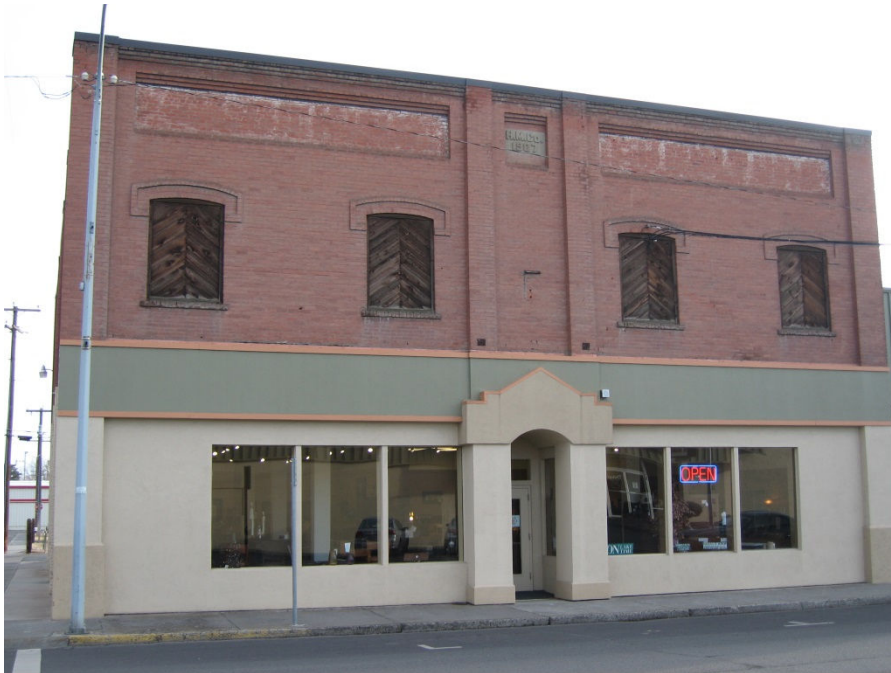
Figure 4: 201 W Hermiston Ave (Donovan Bland Building)