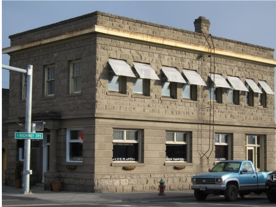
Figure 5: 106 E Main Street (Bliss Building)