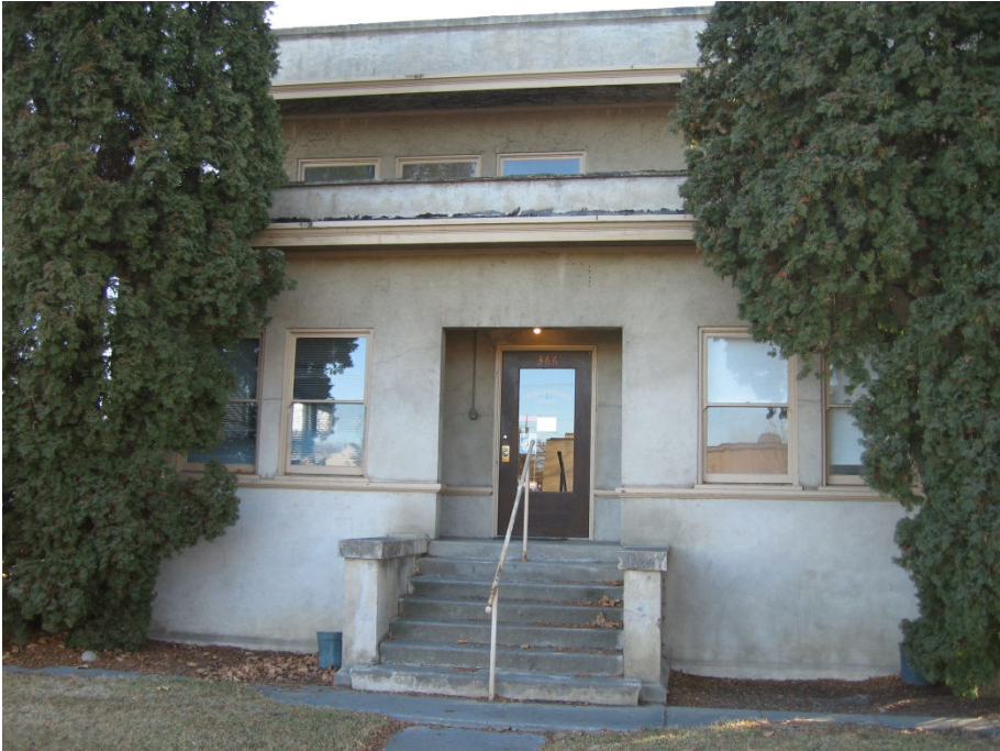
Figure 1: 366 E Hurlburt Ave (Hermiston Irrigation District Building)