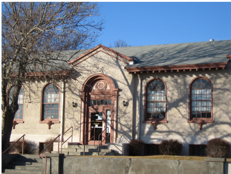
Figure 2: 213 E Gladys Ave (Carnegie Building)