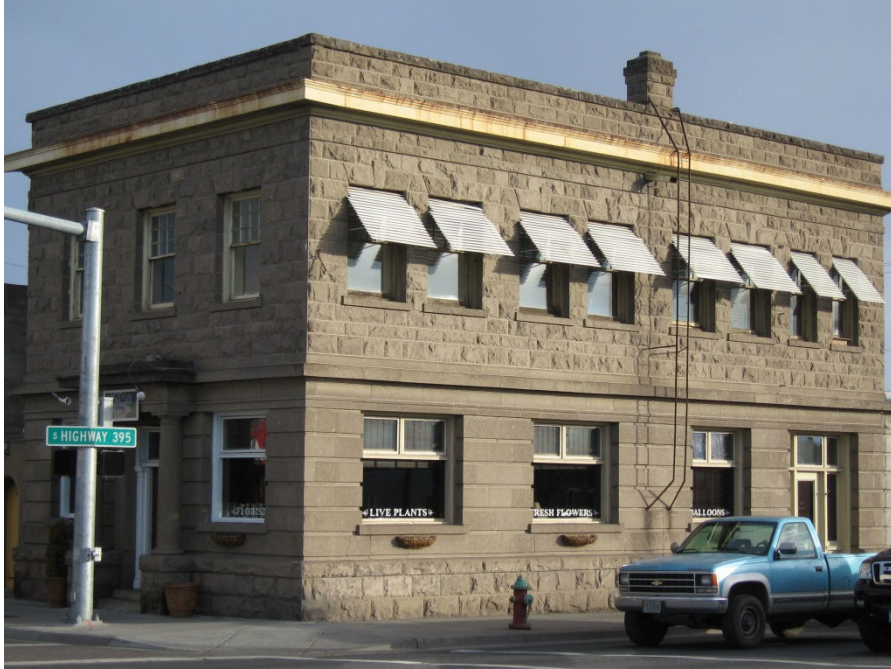
Figure 5: 106 E Main Street (Bliss Building)