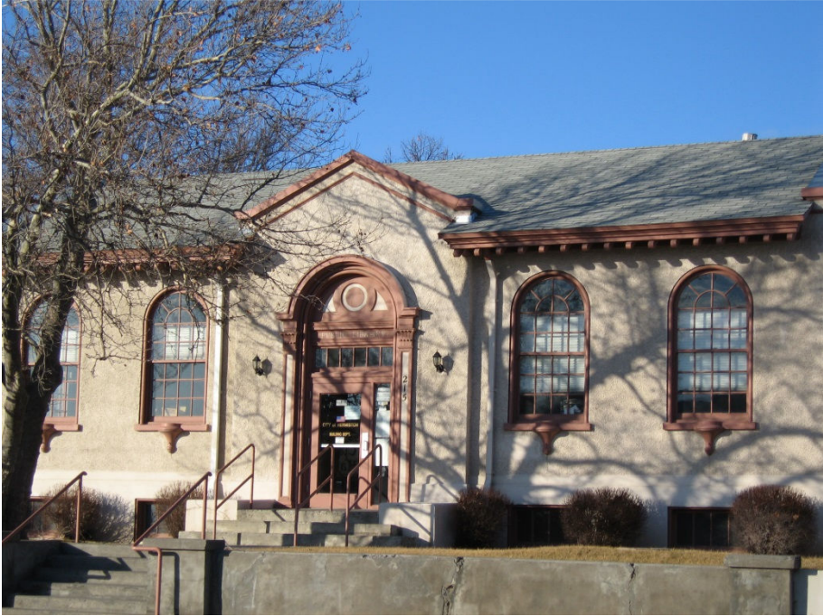
Figure 2: 213 E Gladys Ave (Carnegie Building)