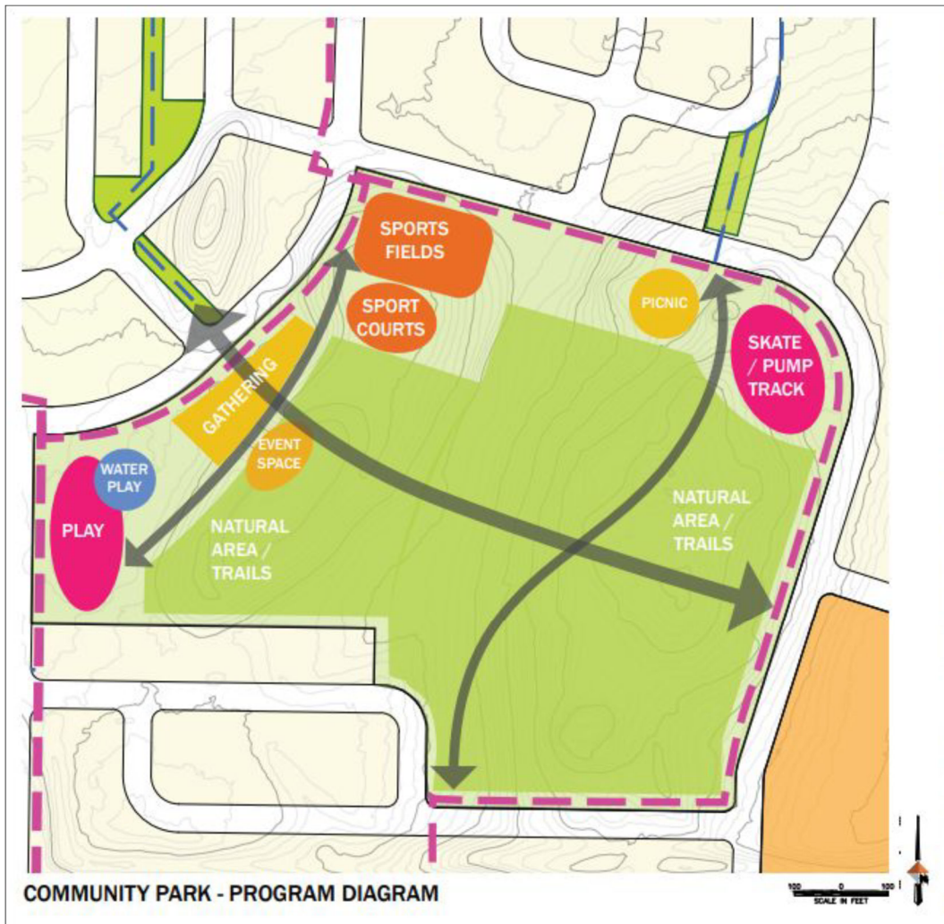
Figure 2 Community Park Conceptual Plan

Develop parks within the Area including but not limited to: (1) A large 38-acre community park with amenities designed to enhance the desirability of the entire area, and (2) several smaller neighborhood parks and trails throughout the Area with amenities designed to serve more local demands within the Area..